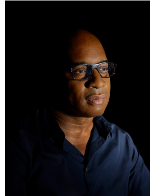
Image credits, L to R: Andy Warhol to Elizabeth (Self-Portrait Artist) from the 700 Nimes Road Portfolio, 2010-11. Pigment print. 16 × 22 in. (40.6 × 55.9 cm). Glenn, 2013. Pigment print. 33 × 25 in. (83.8 × 63.5 cm). Both images ©Catherine Opie, Courtesy of Regen Projects, Los Angeles and Lehmann Maupin, New York & Hong Kong.

LOS ANGELES —In a collaborative effort to present work by the Los Angeles-based artist Catherine Opie (b. 1961, Sandusky, Ohio), The Museum of Contemporary Art, Los Angeles, and the Hammer Museum showcase two solo exhibitions simultaneously; Catherine Opie: 700 Nimes Road and Catherine Opie: Portraits .